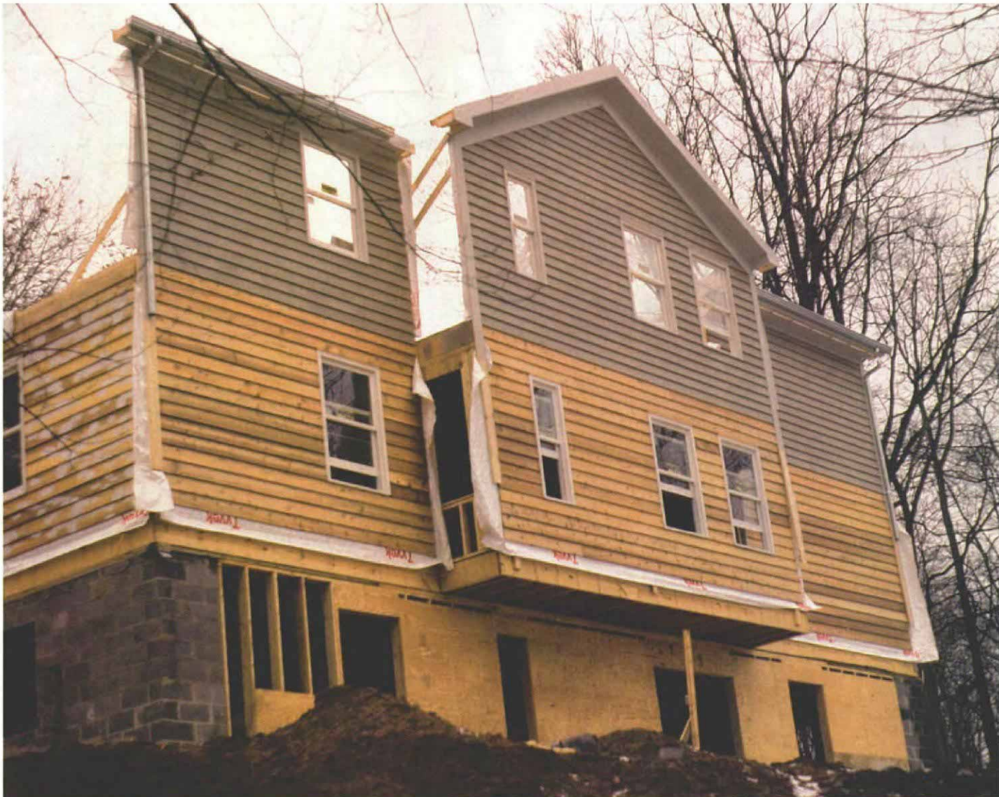
Unaccustomed to seeing finished walls rise up without a house behind them, passersby slammed on their brakes when they saw this spec house in Lexington, Virginia. An advantage of prefabricating walls is that prospective homebuyers get a sense of the finished product long before it's finished.

before raising. Like windows, door jambs extend \frac{1}{2} in. beyond the framing on the inside. But unlike windows, the doors run all the way to the floor, and because the bottom plate was toenailed to the deck, there was no way to shim up the wall at the bottom to provide clearance for the door jambs. So walls with doors were sheathed, but not sided.