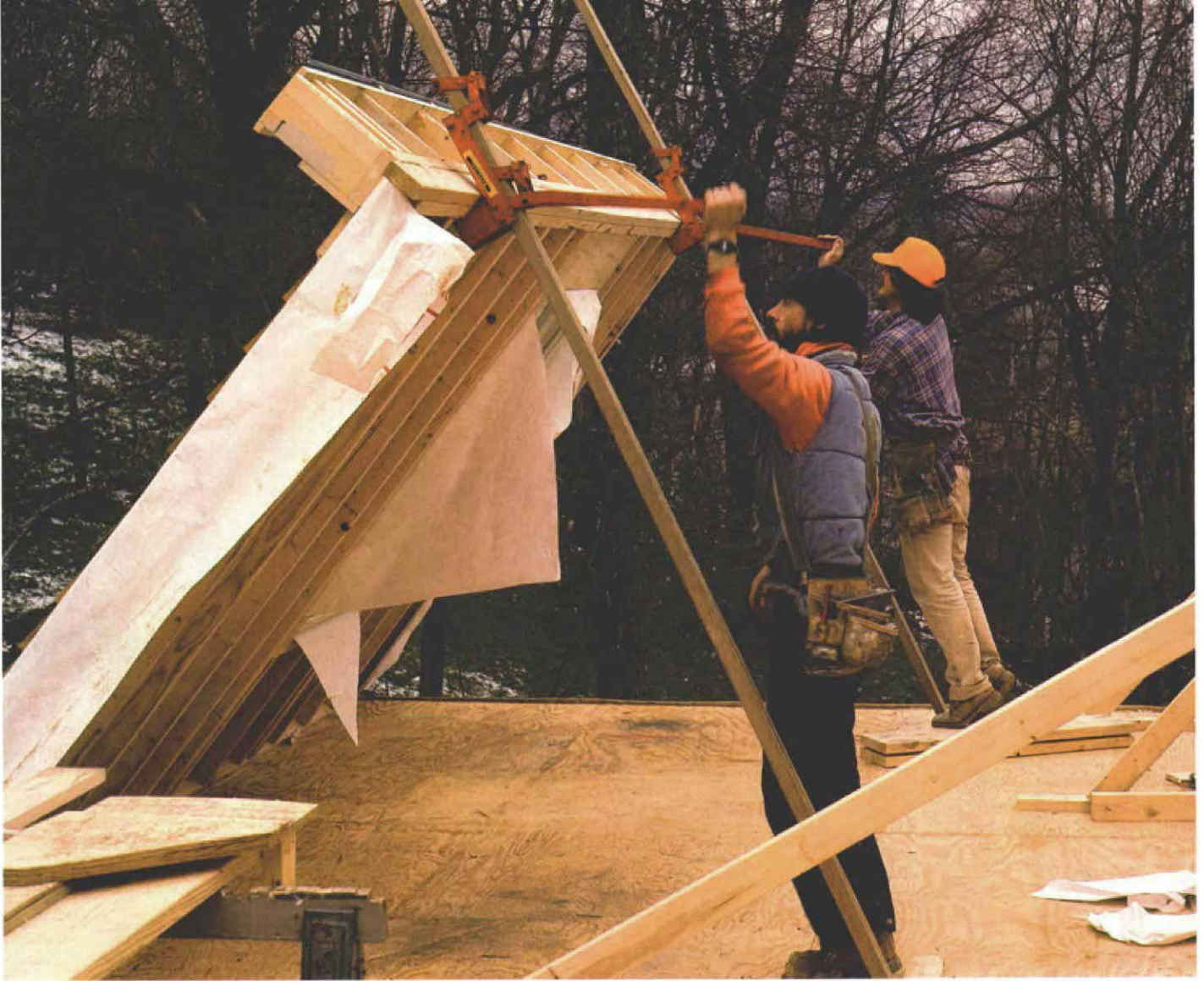
With the added weight of plywood, windows, siding and soffits, even a short wall quickly becomes too heavy to raise by hand. But a pair of wall jacks, braced at the bottom and levered at the same rate, make short work of the task.

clapboard on the second-floor wall would extend far enough past the bottom plate to hook over the siding on the rim joist, when the wall was raised. That one clapboard—at the bottom of the second floor—had to be nailed off later from a ladder.