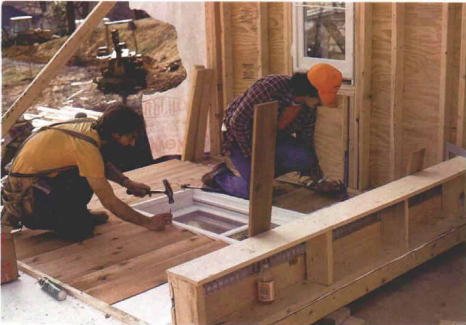
Windows were tacked in place temporarily. Then, the clapboards that butted into the windows were all cut the same length and were used to square up the windows. After the siding was installed, the windows were nailed permanently.

The second floor —After framing the interior partitions, straightening and leveling walls, the crew framed the second-floor deck. Before sheathing it, however, they sheathed and sided the rim joist. Doing this by bending over from the deck after it was sheathed would have been dangerous. Instead, they worked from stepladders set up inside the house, leaning over the rim joist to take measurements, snap chalklines and nail. The rim-joist sheathing was cut so that it was about ¼ in. below the top of the joist, and the last clapboard was installed so that its top was below the top of the rim joist. This way, the bottom of the first