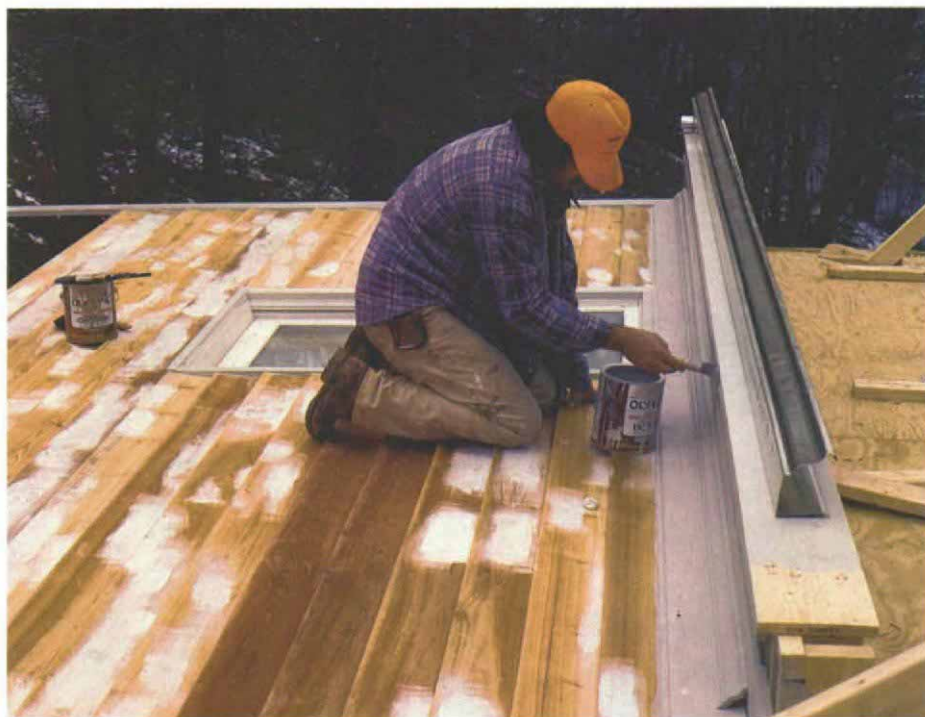
If you've ever painted a soffit while perched on a ladder, with paint dripping in your face and your neck aching from craning upward, you can appreciate another advantage of prefabricating walls: kneeling down to paint soffits.

On the eave walls, which would be raised