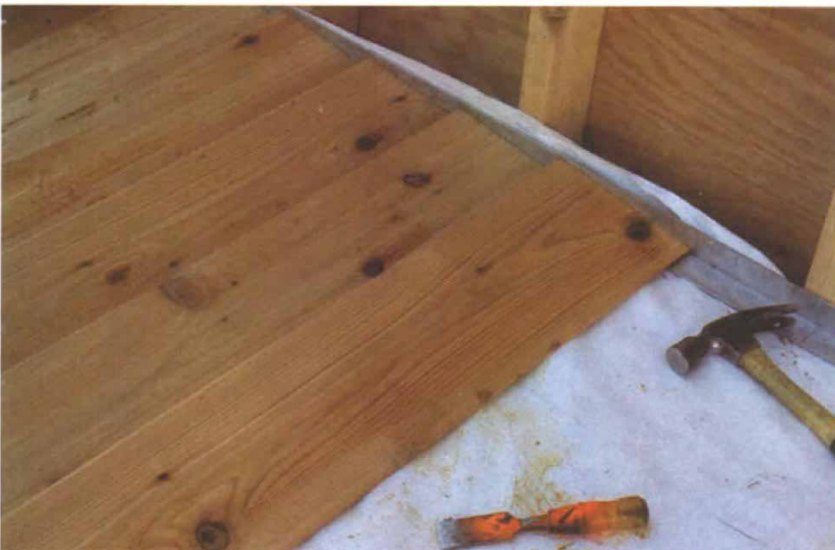
Clapboards had to be neatly aligned so that the corner boards, which couldn't be installed until after the walls were raised, would fit precisely. On eave walls, where the clapboards ran to the end of the framing, aluminum angles were used as a jig to align the ends of the siding.